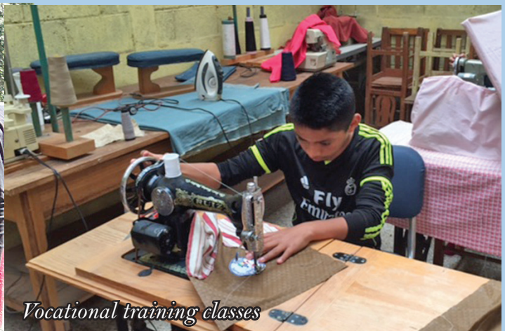
Vocational training classes