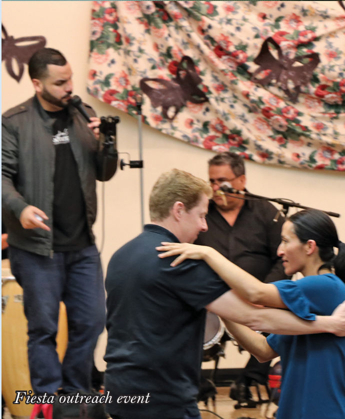
Fiesta outreach event