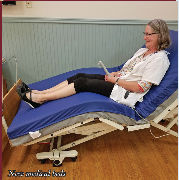
New medical beds