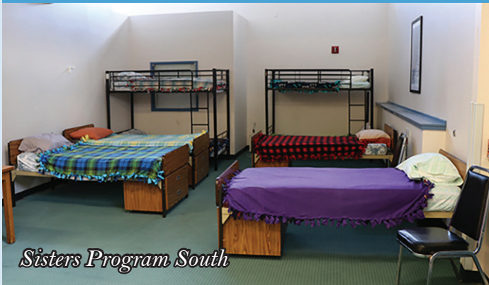
Sisters Program South