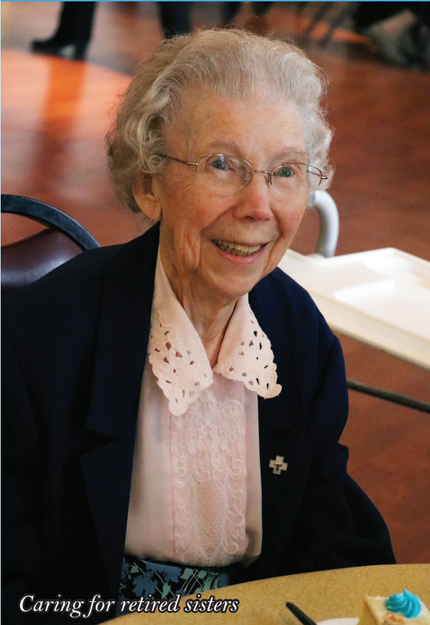
Caring for retired sisters