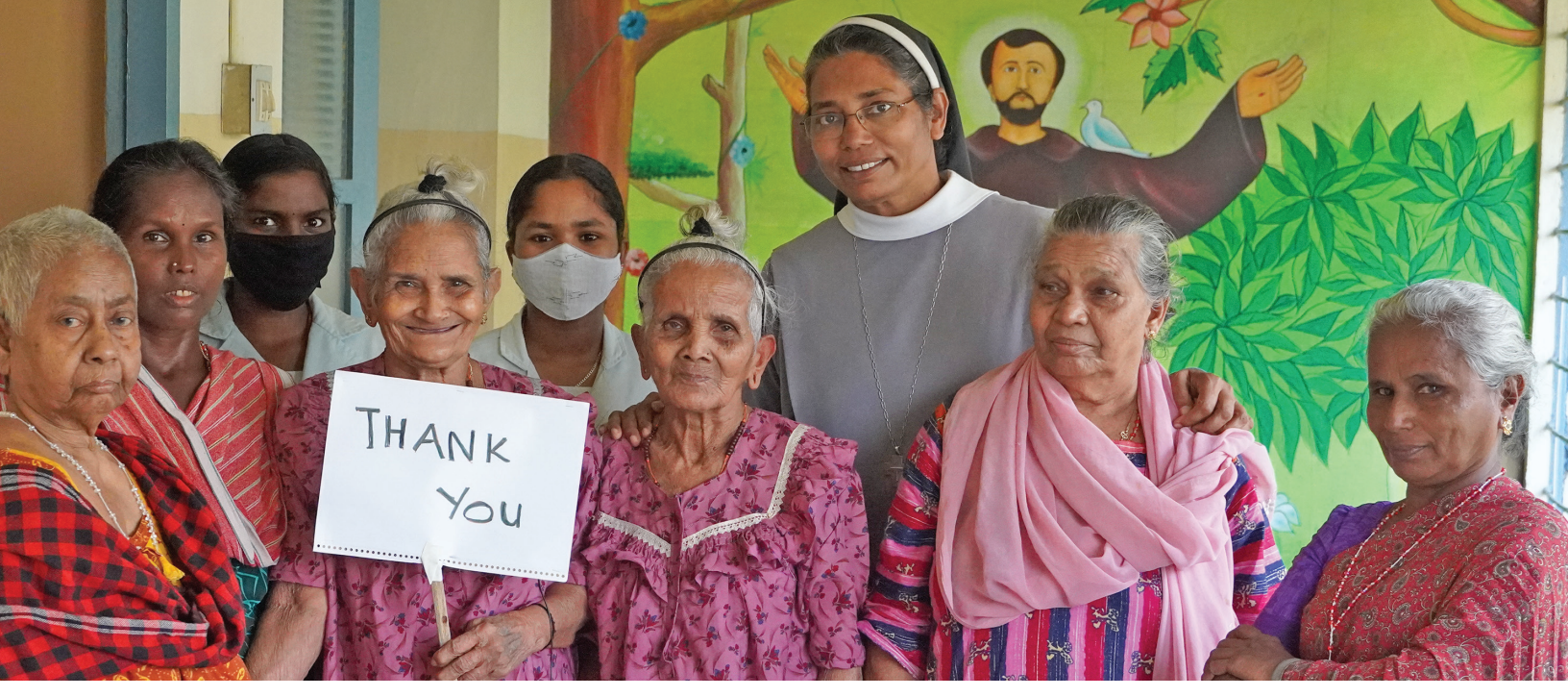
Your gifts provided living and medical expenses, along with solar power equipment, to Assisi Care Home, where our sisters serve extremely poor women in Kanjikode, India.