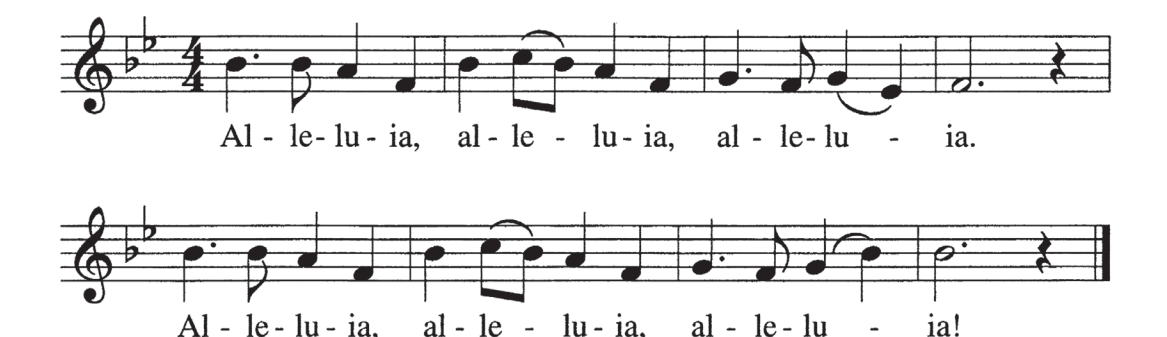
Copyright © 1999 MorningStar Music Publishers of St. Louis 1727 Larkin Williams Road, Fenton, MO 63026. Printed in U.S.A.