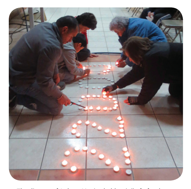
The diocese of Juárez, Mexico held a vigil of of 43 hours to pray for the 43 students of Ayotzinapa and their families. They also remembered the more than 22,000 persons who have disappeared since 2007. The School Sisters of St. Francis helped coordinate the prayer service for their parish, Jesús Obrero.

The people of Mexico are no longer silent! The challenge will be to purge the current political system criminal elements and create realistic alternatives – a herculean task.